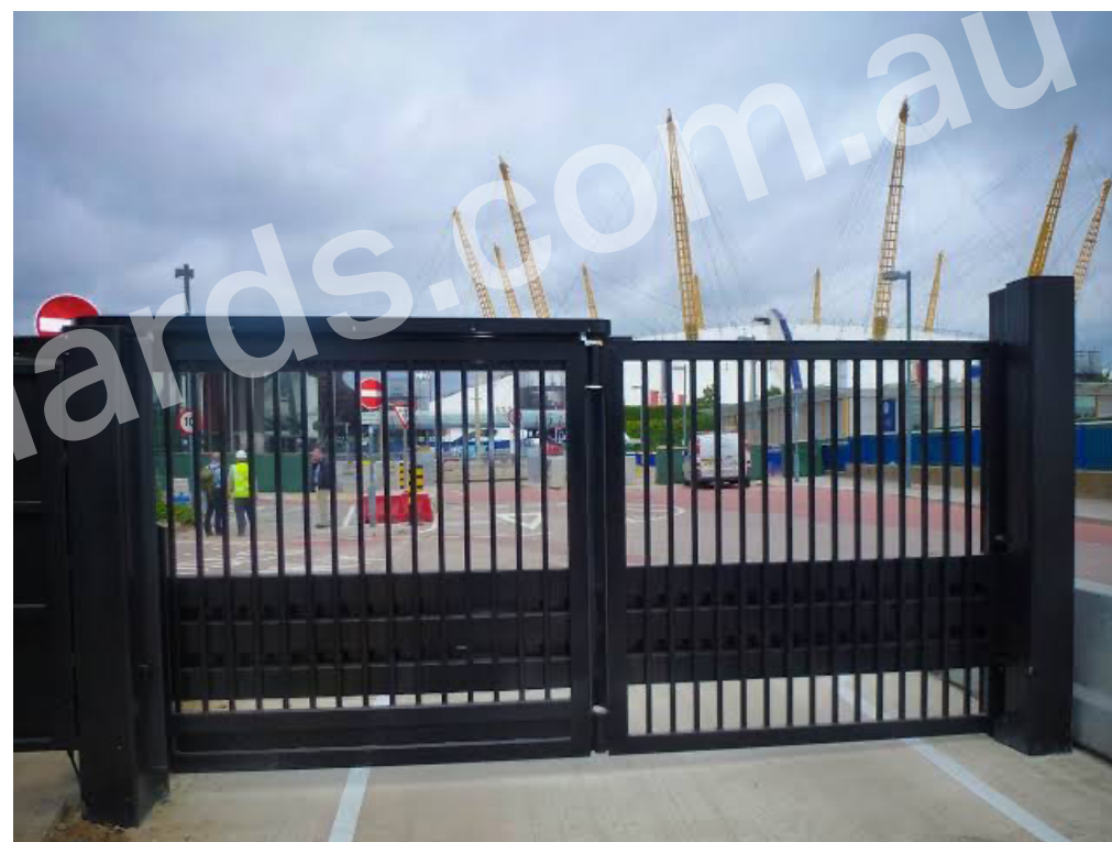
PAS 68:2010 V/7500[N2]/64/90:5.6/10.1