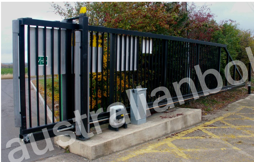
PAS 68:2010 V/7500[N3]/80/90:1.6/5.4

The gate is either electrically or hydraulically driven dependant on client specification. The gate has a locking pin ensuring that it is secure before impact. The gate is very smooth and quiet with exceptional control in both directions. It has a powerful PLC with built in diagnostics and programmable inputs and outputs that can provide numerous options depending on client requirements. In the event of a power failure the gate has a full manual override system. The option of a powerful hydraulic motor is also available.